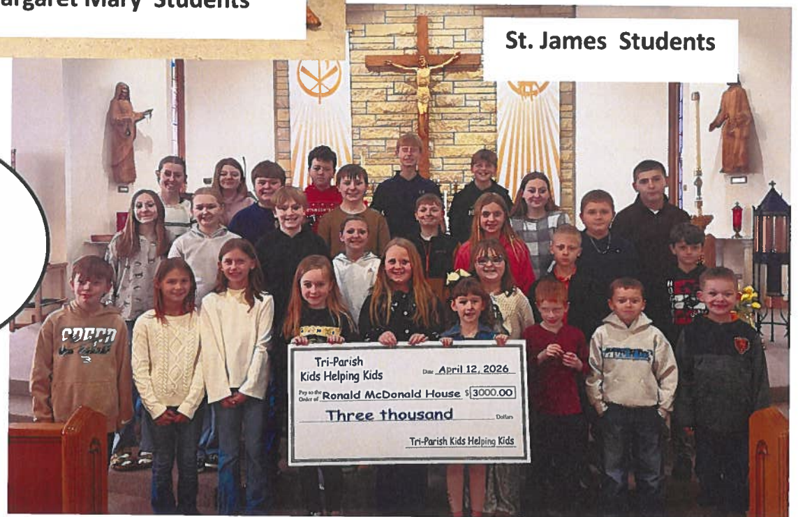
St. James Students

The St. James RE students would like to thank everyone for their support of the Kids Helping Kids program. We are very proud of all the money we raised for the Ronald McDonald House