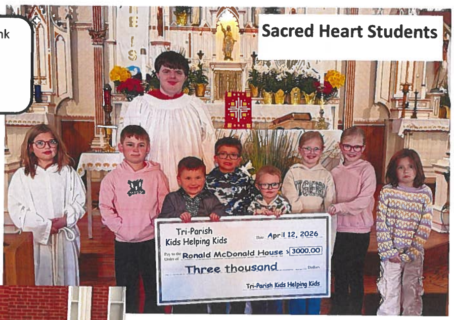
Sacred Heart Students

Thank you from all the students at St. Margaret Mary that you supported through your donations to help them achieve their goal of supporting the Ronald McDonald House. We are proud of our students