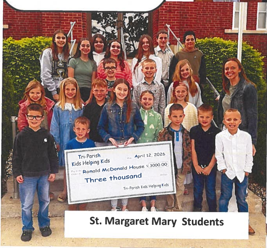
St. Margaret Mary Students

Thank you from all the students at St. Margaret Mary that you supported through your donations to help them achieve their goal of supporting the Ronald McDonald House. We are proud of our students