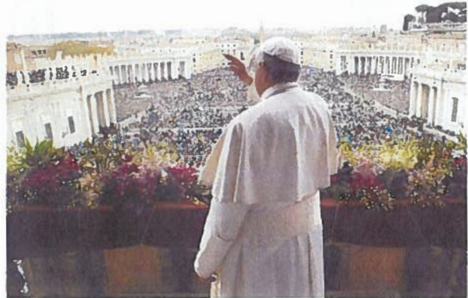
Pope Francis gives the Urbi et Orbi blessing for the city of Rome and the entire world on April 5, 2015.