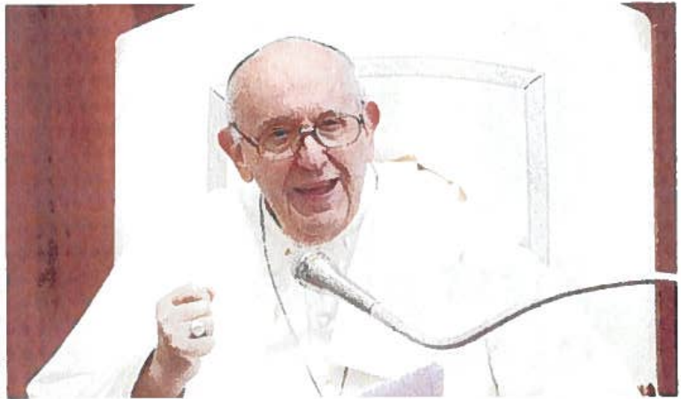
Pope Francis during the general audience at St. Damaso Courtyard at the Vatican on May 12, 2021.

"Parents, can you 'waste time' with your children? It is one of the most important things you can do each day."