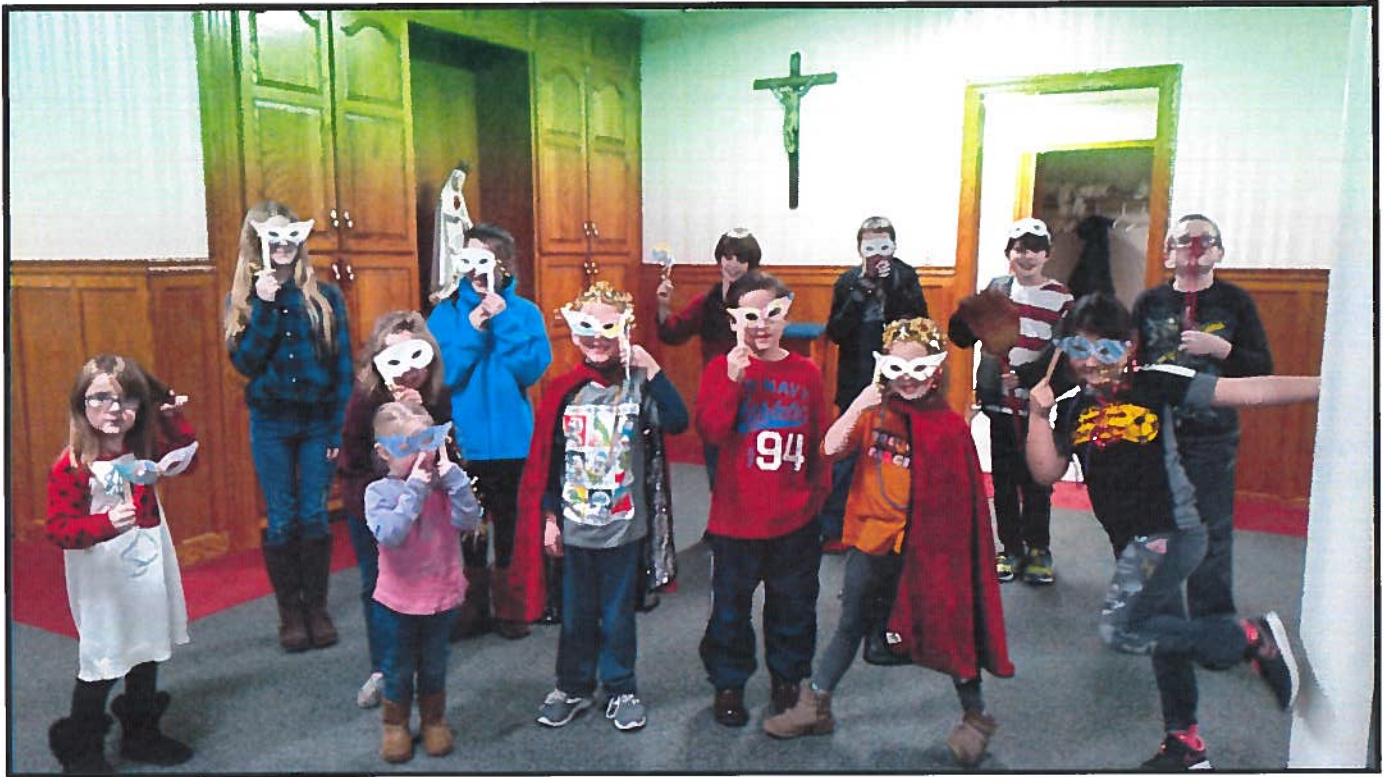
St. Margaret Mary families celebrated Mardi Gras with masquerade masks, yummy food and authentic paczki! Thanks to our families for attending!