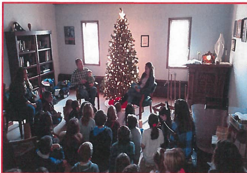
St Margaret Mary's religious education celebrated the Epiphany by recreating the wise men's journey and meeting the holy family.

Please gather at St. James at 7 pm on Wednesday, January 22 as we join the nation in praying the rosary for those who cannot protect themselves.