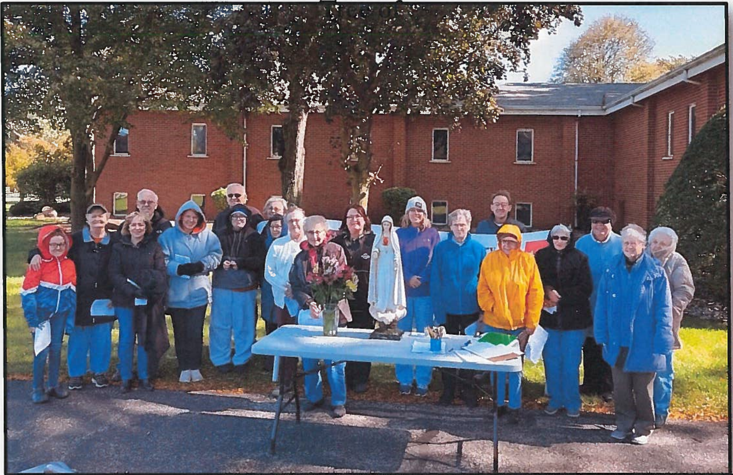
Rosary Rally 2019—Thank you to all who braved the cold windy day to pray the rosary for our country on October 12.