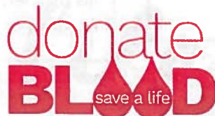
Photo ID required